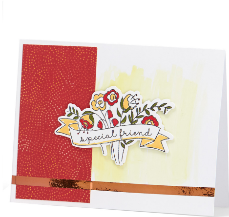
5½" × 4¼" SPECIAL FRIEND CARD