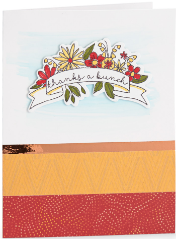
5½" × 4¼" THANKS A BUNCH CARD